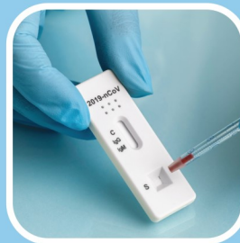
LABS & TESTING